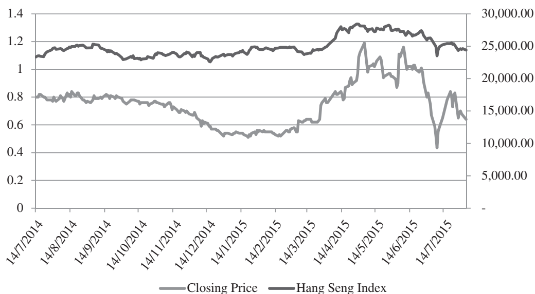
Figure 2: Share price vs Hang Seng Index